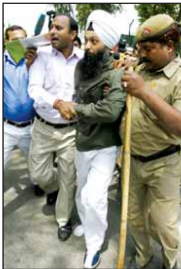
He still has a shoe, and there are so many who deserve it so richly

Oh yes, some of the people find it a very bad thing to do.